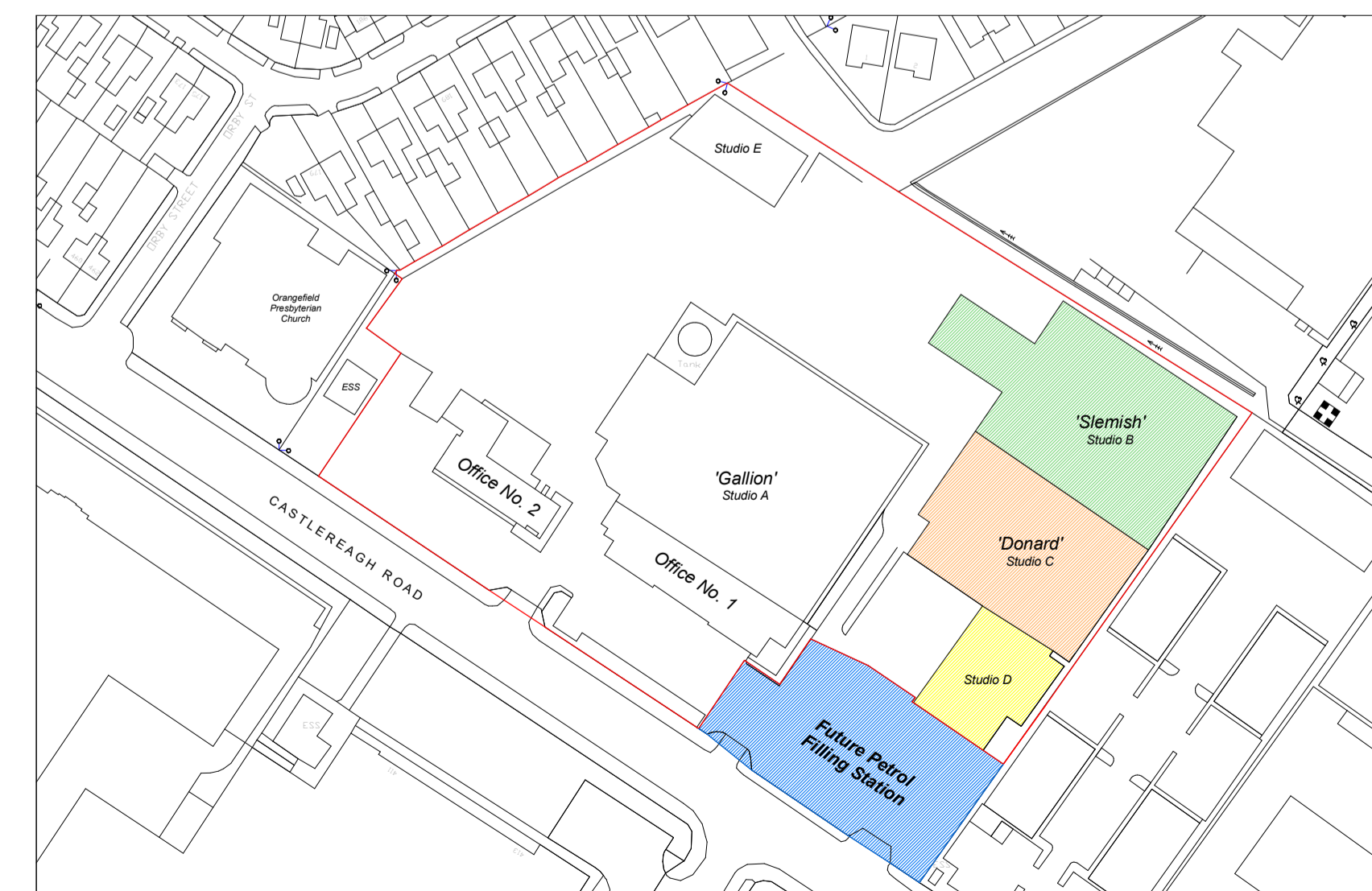
Indicative Site Plan - Not to scale